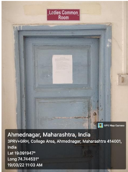
3. Ladies Common room