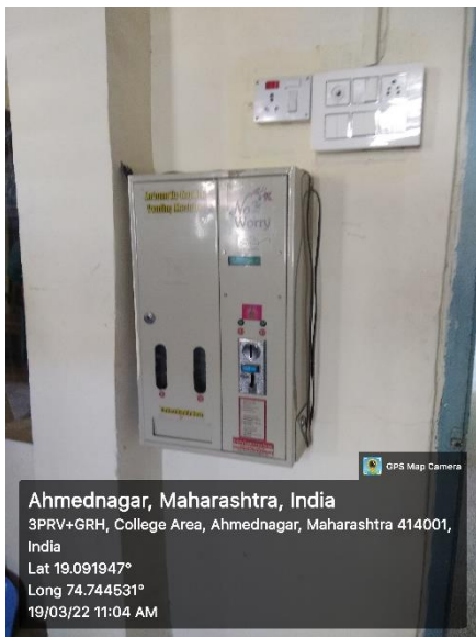
4. Pad vending machine at ladies' common room