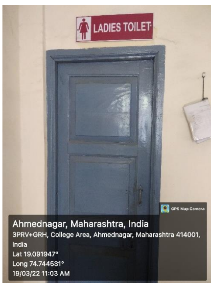
5. Separate washroom for ladies